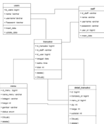
Figure 6. Class Diagram

5. Class Diagram: describes the relationships between classes and describes in detail each class in the system design model. This diagram also displays the rules and responsibilities of each entity that affect the overall behavior of the system Here: [14] .